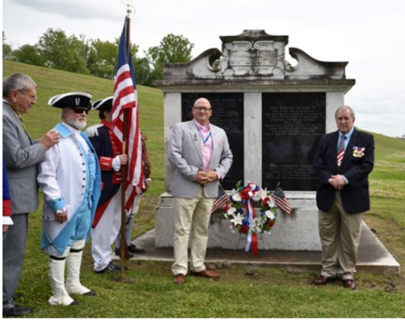
Wreath laid by George Washington Chapter