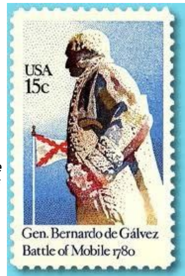
U.S. postage stamp, 1980