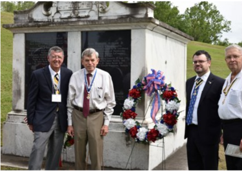
Wreath laid by General Philemon Thomas Chapter