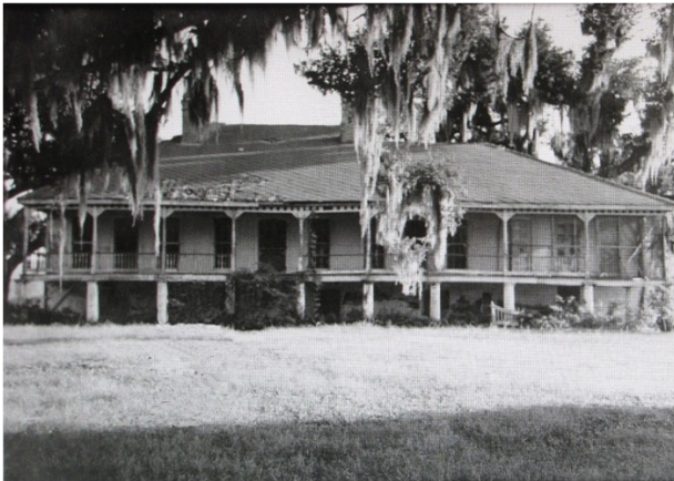
Armant Plantation was located just north of present day Laura Plantation in Vacherie. The main house was built in 1793 and survived until being razed in 1969.