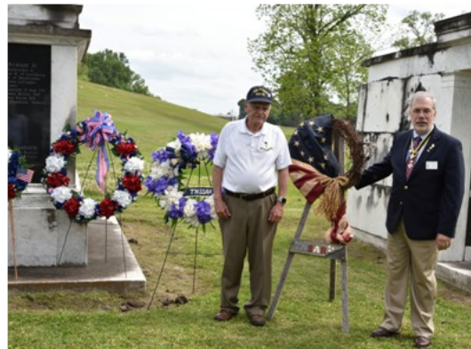
Wreath laid by Tennessee State Society