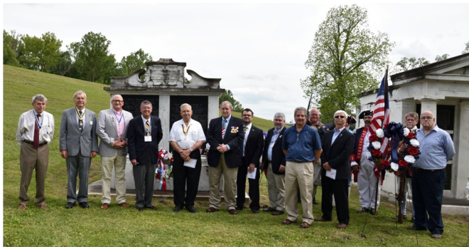
Members of the Louisiana Society Sons of the American Revolution at the Wreath Laying Ceremony and the Color Guard retiring the colors.