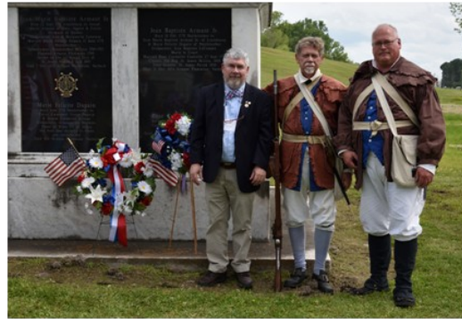
Wreath laid by James Huey Chapter